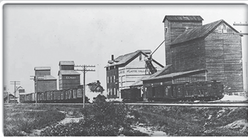
ABOVE: The section of railroad through Gothenburg was inspected and accepted by Union Pacific in November 1866. The town was platted by UP surveyors in 1882.