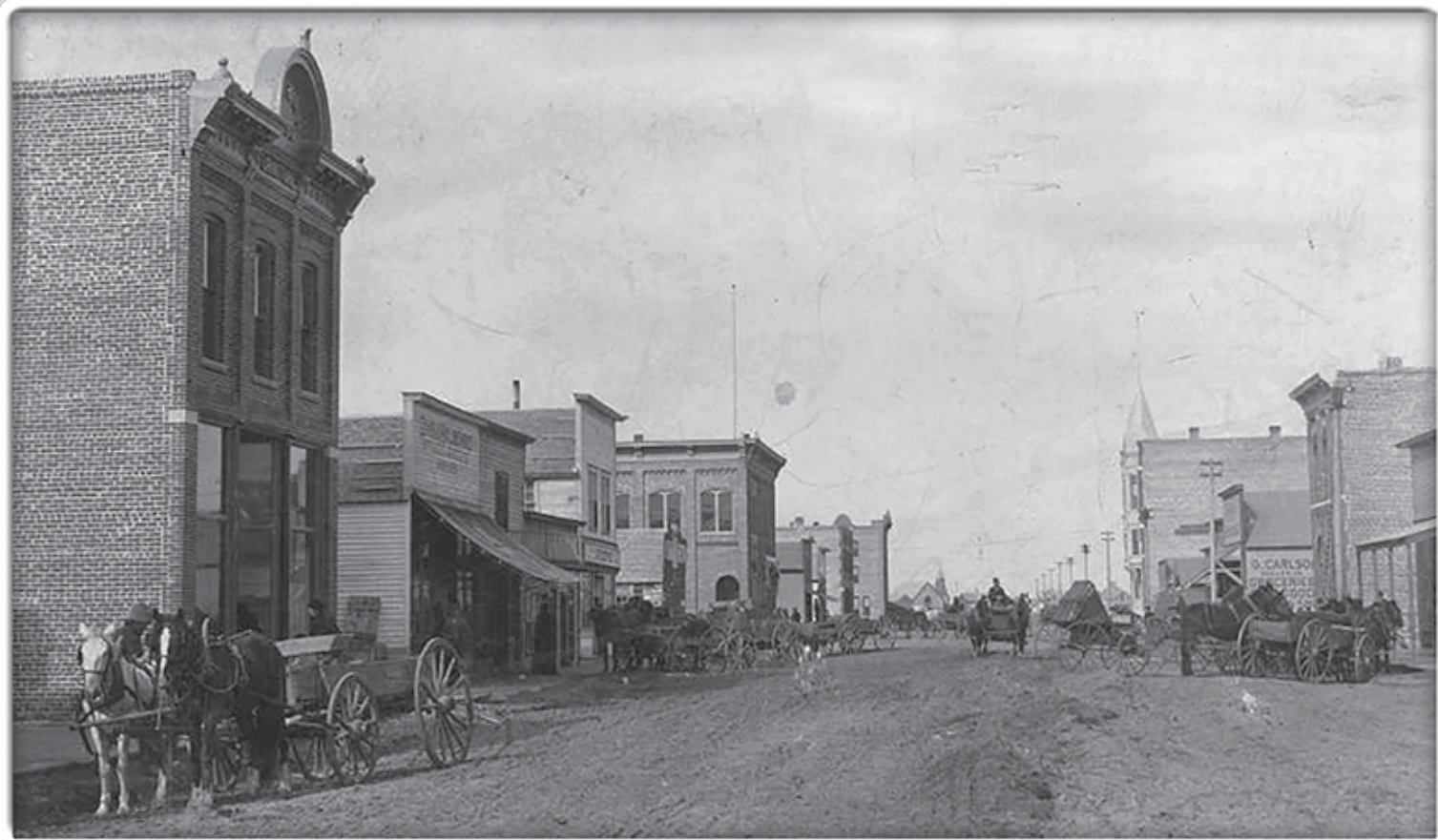
The main north-south street and business district of Gothenburg was originally called Winchell Street, named after one of the first families to settle here. It was renamed Lake Avenue in 1920.